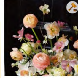
Flower Arranging Workshop with Jennifer Fiss