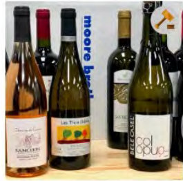
Year of Moore Brother's Wine