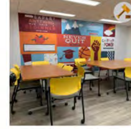
Pizza Party in the Huskies Hangout