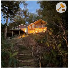
Chesapeake Bay Escape