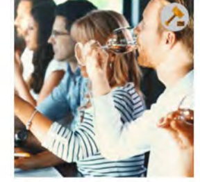
Private Wine Tasting Class for 10