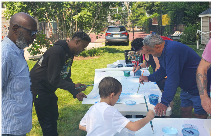
Neighbors painting Adult Education mural pictured above

Wellness Weekends are more than an event or workshop. This is a journey and as a community we are coming together to learn, grow and love ourselves. Health isn't a destination, it takes time, patience, compassion and a can-do attitude. Join us for these amazing experiences, whether you are a health guru/expert or just beginning your own journey.